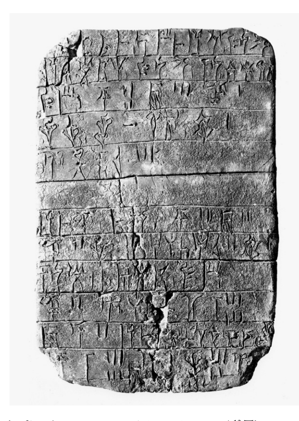
Figure 1. Pylos tablet Un 718. H. 19.7, W. 12.7, Th. 1.9 cm. Scale 1:2.

two corporate bodies (dāmos, wo-ro-ki-jo-ne-jo ka-ma). The prominence of e-ke-ra<sub>2</sub>-wo is quite striking: he is the first contributor listed and he provides about half of the total foodstuffs for this feast, including the only bull (see Table 1). The rest of the foodstuffs will be provided by the dāmos, a regional corporate body that is chiefly associated in the Linear B texts with the supervision of landholdings and agricultural activities; the lāwāgetās, the second most important officer of the palatial administration; and the enigmatic wo-ro-ki-jo-ne-jo ka-ma, probably a collective body associated with landholding. The total amount of food recorded on Un 718 is adequate to feed well over 1,000 people; the wheat alone would have been sufficient to provide 990 daily rations for dependents of the palace. It seems clear, therefore, that e-ke-ra<sub>2</sub>-wo is an important personage on a local level, if not in the kingdom as a whole.